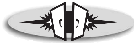
Table of Contents continued